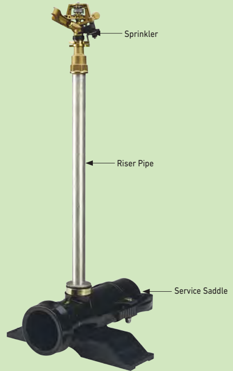
433 PC - Assembly

P = Pressure; Q = Discharge; D = Diameter