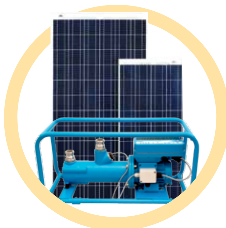
Jain Sunlight Pump