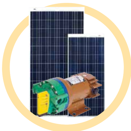
Jain Nano Pump