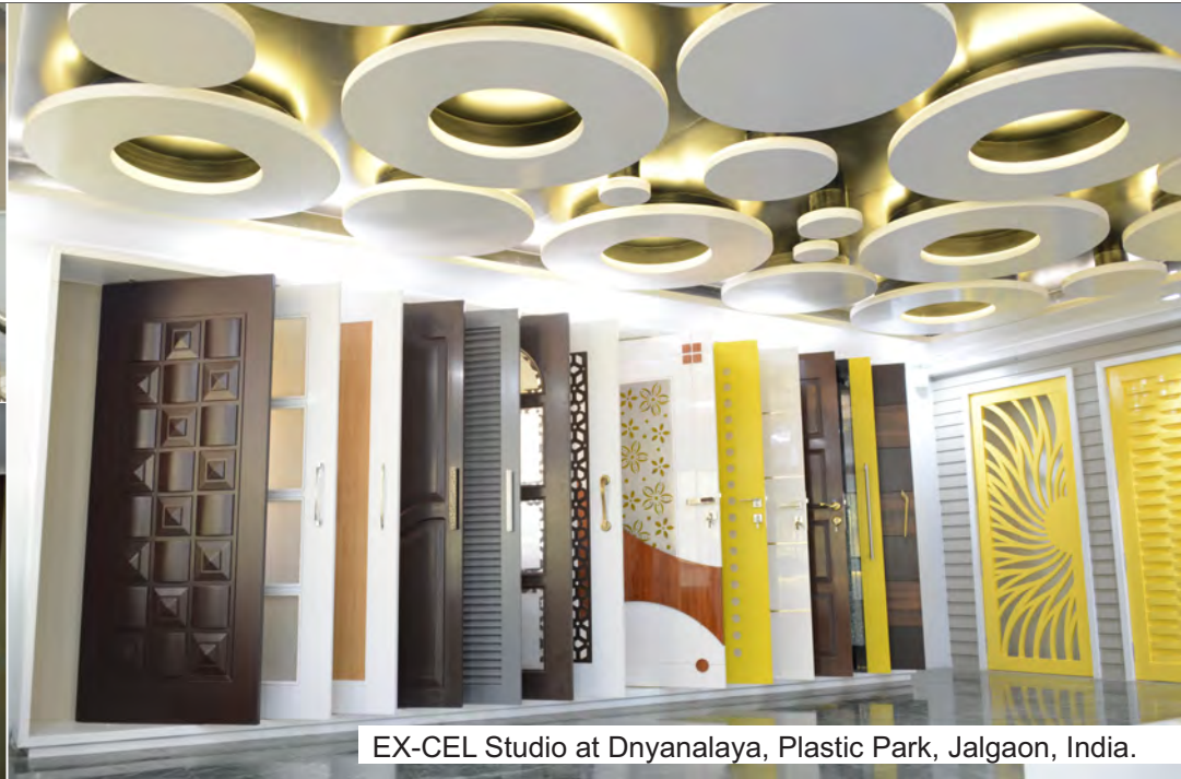
EX-CEL Studio at Dnyanalaya, Plastic Park, Jalgaon, India.