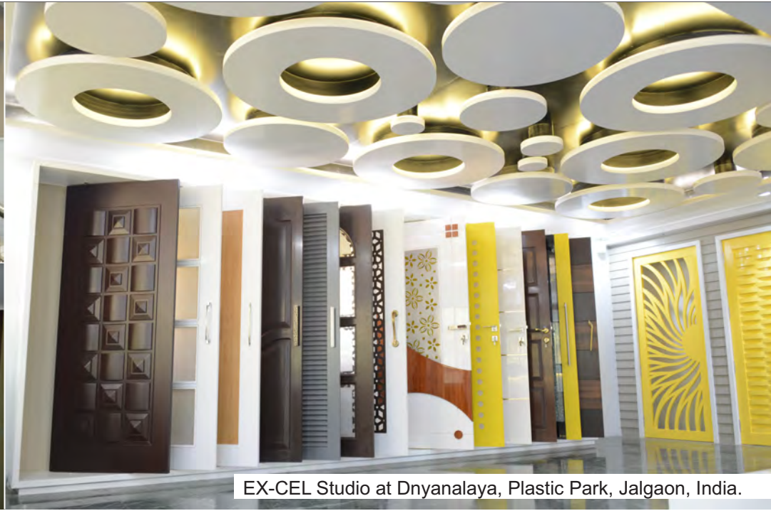
EX-CEL Studio at Dnyanalaya, Plastic Park, Jalgaon, India.