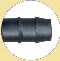
Dual Barb Design

Dual barb fitting used for connecting one or more lateral outlets from one connection (from submain)