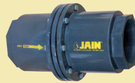
Low Friction Non Return Valve