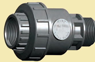
Check Valve - Single Union Type