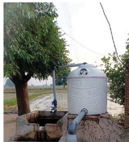
Ultra Low energy drip at Punjab

With Aeroponics, a grower can take the exact same seed from the field and grow it in half the time than a traditional field farmer, leading to 390 times more productivity per square foot when compared to