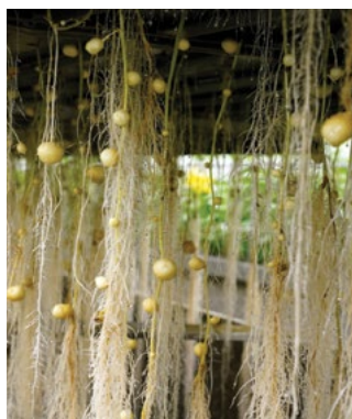
Potato grown with aeroponic system