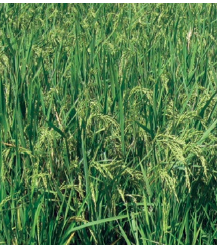
Rice with drip

these questions. Jain Logic is an amalgam of Digital - Tech Solutions created to fulfill precision agriculture and irrigation management requirements. It includes monitoring and control devices, software applications and real time analytical intelligence and prediction analysis for decision support systems.